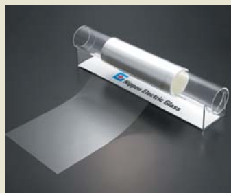
Ultra-thin glass sheet (page 30)