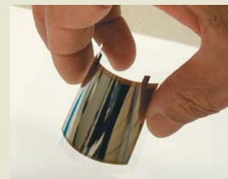
Lithium ion secondary battery with a 30µm glass substrate (page 30)